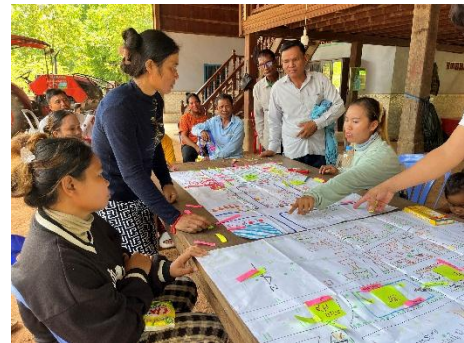
Fig. 7 Participatory rural appraisal for discussing on a greening plan in Siem Reap Province