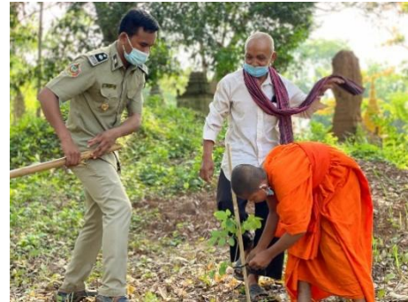
Fig. 3 Planting activity in Kampong Cham Province

Based on the questionnaire survey conducted among residents after the workshop, approximately 65% of residents understood what they learned in the workshop, and more than 90% were aware of the importance of being involved in management practices after planting by themselves. The results highlight the importance of continuing awareness programs through tree planting activities at the grassroots level.