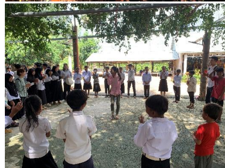
Fig. 5 Nature game workshop facilitated by school teachers in Tboung Khmum Province

Additionally, two model schools practiced seedling propagation under the supervision of the Forestry Administration, producing 6,000 native tree seedlings that were used for replanting in the communities. Moreover, the capacity building of the school teachers was further strengthened through workshops, where 16 school teachers from three schools developed their original Nature Games, and performed them for their students at the planting sites of Chitheang Lake. At the end of the project, these three schools were awarded under the title of “Excellence in Forest Environmental Education” in recognition of their greater engagement in promoting forest environmental education in Cambodia, acknowledged by the Tboung Khmum Provincial Department of Education, Youth and