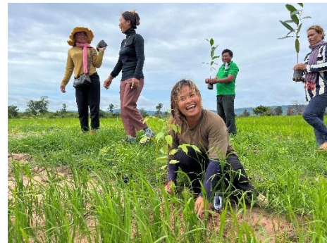
Fig. 6 Reforestation activity under agroforestry system in Siem Reap Province

Through the analysis of qualitative and quantitative data acquired through the observation of the workshops, PRA tools, and questionnaire surveys, the key deforestation drivers and their impacts on local communities were identified. The findings highlight the urgent need to develop a forest resource management system and long-term capacity-building programs in the community. Participatory Rural Appraisal (PRA) has been proven to be an effective approach that contributes to raising