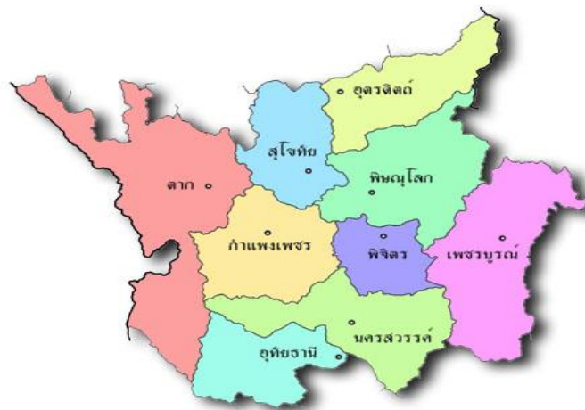
Fig. 1 Map of lower northern region of Thailand

The Study Population was comprised of agricultural cooperatives Ltd. which operated in 9 provinces in the lower northern region of Thailand which include Kampanget, Tak, Nakhonsawan, Pichit, Pitsanulook, Petchabul, Sukhothai, Utaradit Provinces, and Uthathani Province which accounted for 196 cooperatives.