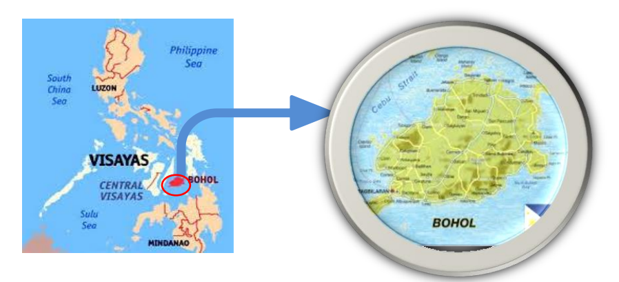
Fig. 1 The study site: Bohol, Central Philippines

The degraded agricultural upland sites being observed by the researcher include the farm communities of Carmen which is an interior municipality and central part of Bohol and the degraded upland farms of Mayana, Jagna and Taytay, Duero in the eastern part of the province.