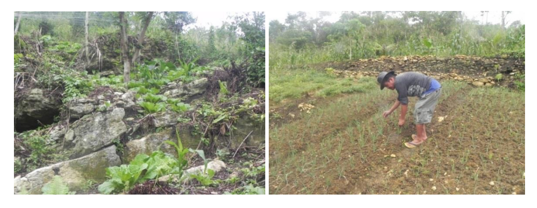
Fig. 3 The severely degraded upland farms of Bohol

At least five different Plio-pleistocene terrace levels ranging in height from 10 to 300 meters have been etched both in Carmen sandstone and shales and Maribojoc limestones.