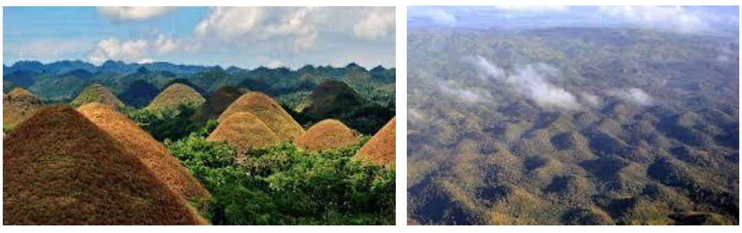
Fig. 2 The degraded uplands of the central part of Bohol

Bohol may have been developed from the magnetic tectonic mechanism which resulted from the under thrusting of the southwest Philippine Plates east of Samar Island and Surigao in Northern Mindanao. The Mines and Geosciences Bureau of the Department of Environment and Natural Resources showed eleven (11) major geologic formations in the Bohol mainland and offshore islands. The most extensive are Carmen formation, Maribojoc and Wahig limestones, Ubay volcanic and Kabulao conglomerates (OIDCI, 2006).