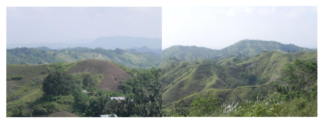
Fig. 5 Farmed steep slopes are common sites in the uplands of Bohol